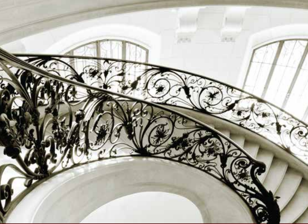
THE CLASSIC FRENCH STYLE CHÂTEAU

When it comes to exuding class, you could simply take your inspiration from the French