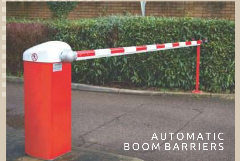
AUTOMATIC BOOM BARRIERS