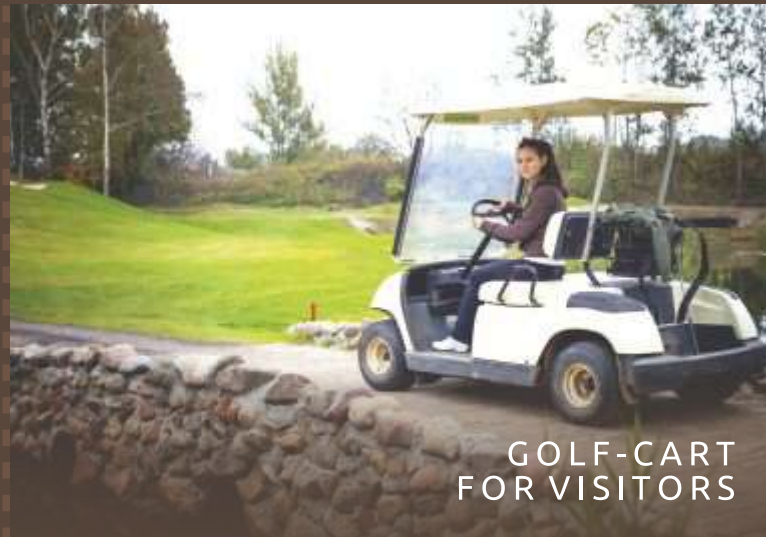
GOLF-CART FOR VISITORS