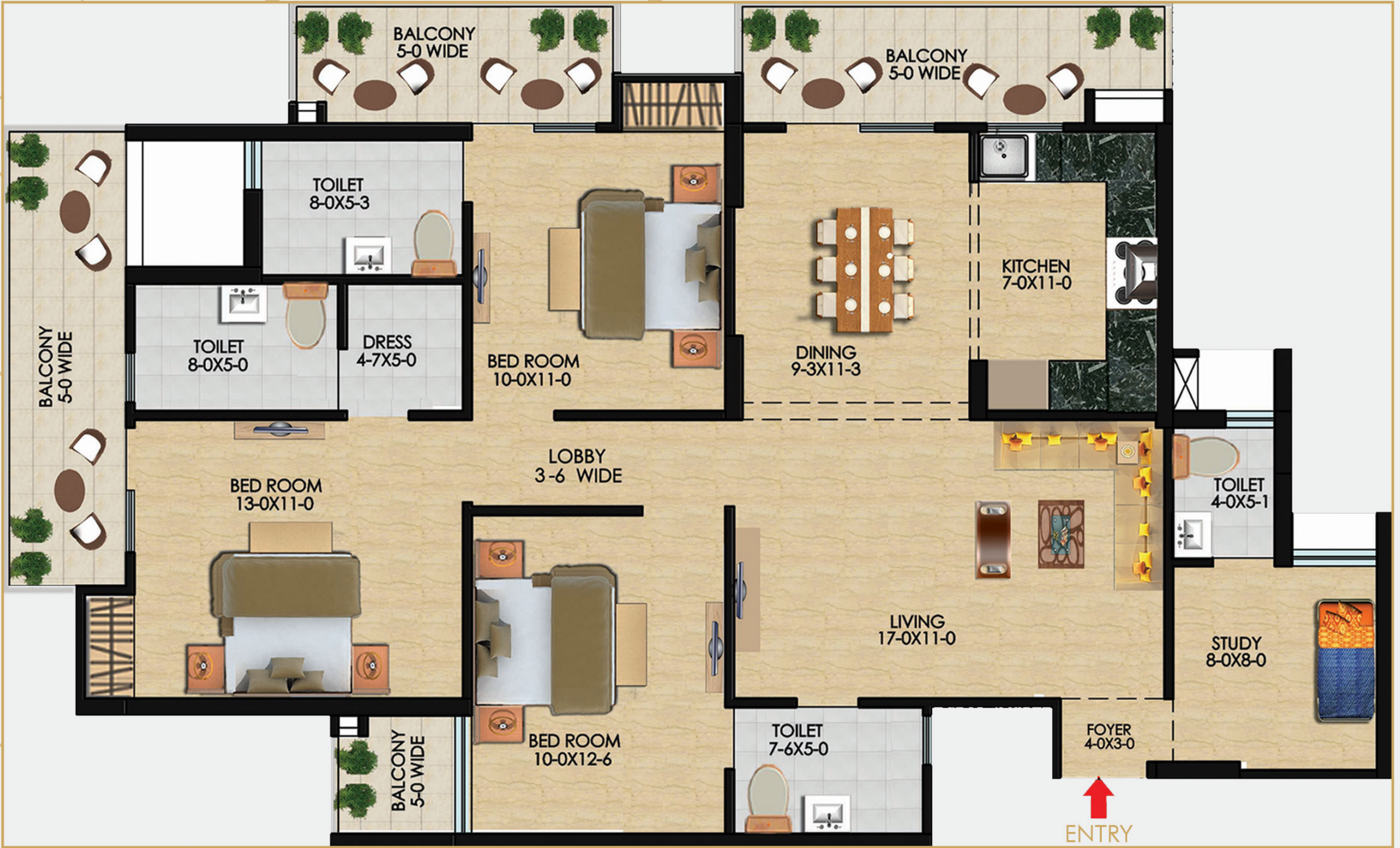
1880 SQ.FT. 3 BED ROOM+3 TOILET DRESS+SER. ROOM+W.C.+ ENTRANCE