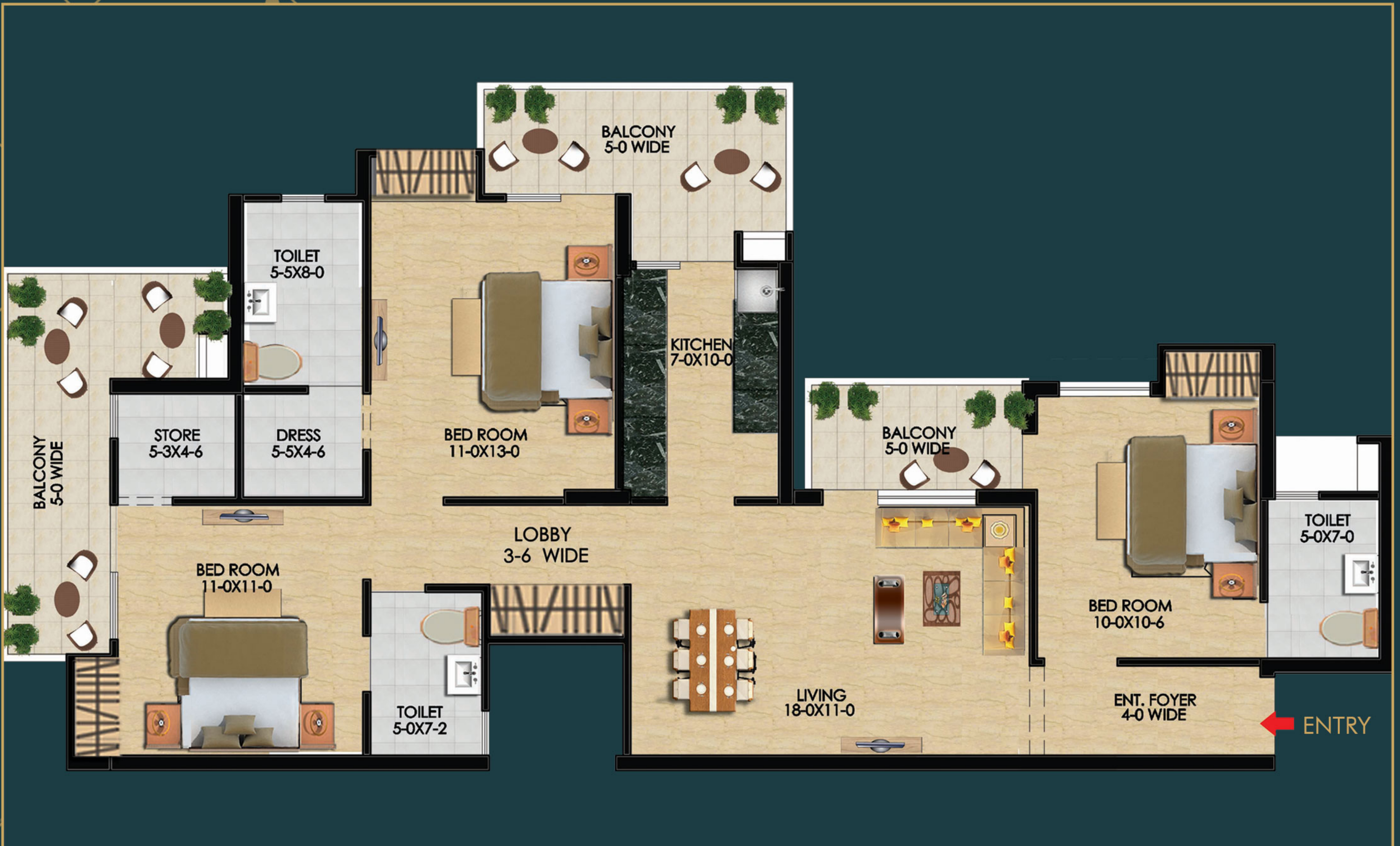
1685 SQ.FT. 3 BED ROOM+3 TOILET DRESS+STORE+ ENTRANCE FOYER