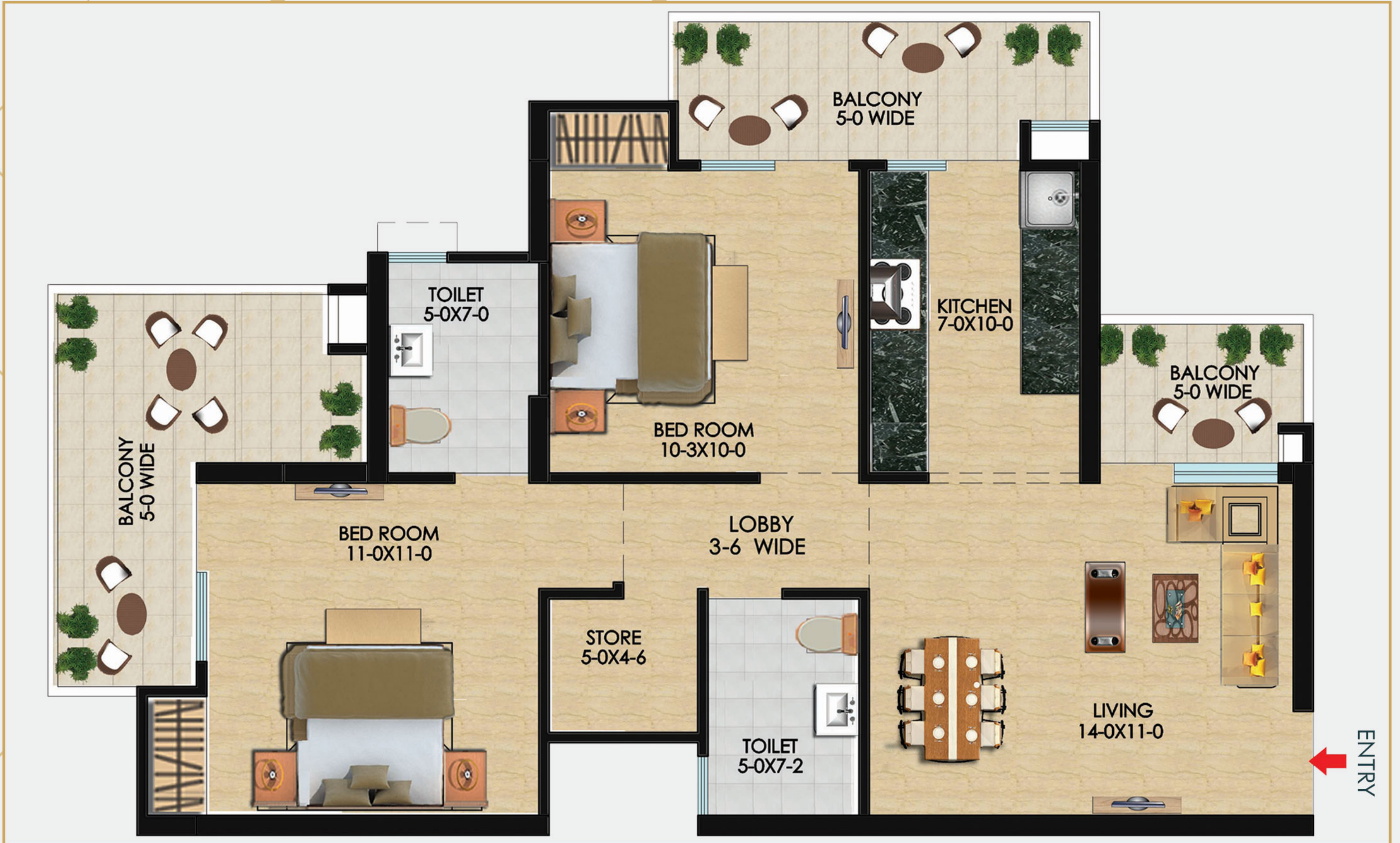
1140 SQ.FT. 2 BED ROOM + 2 TOILET + STORE