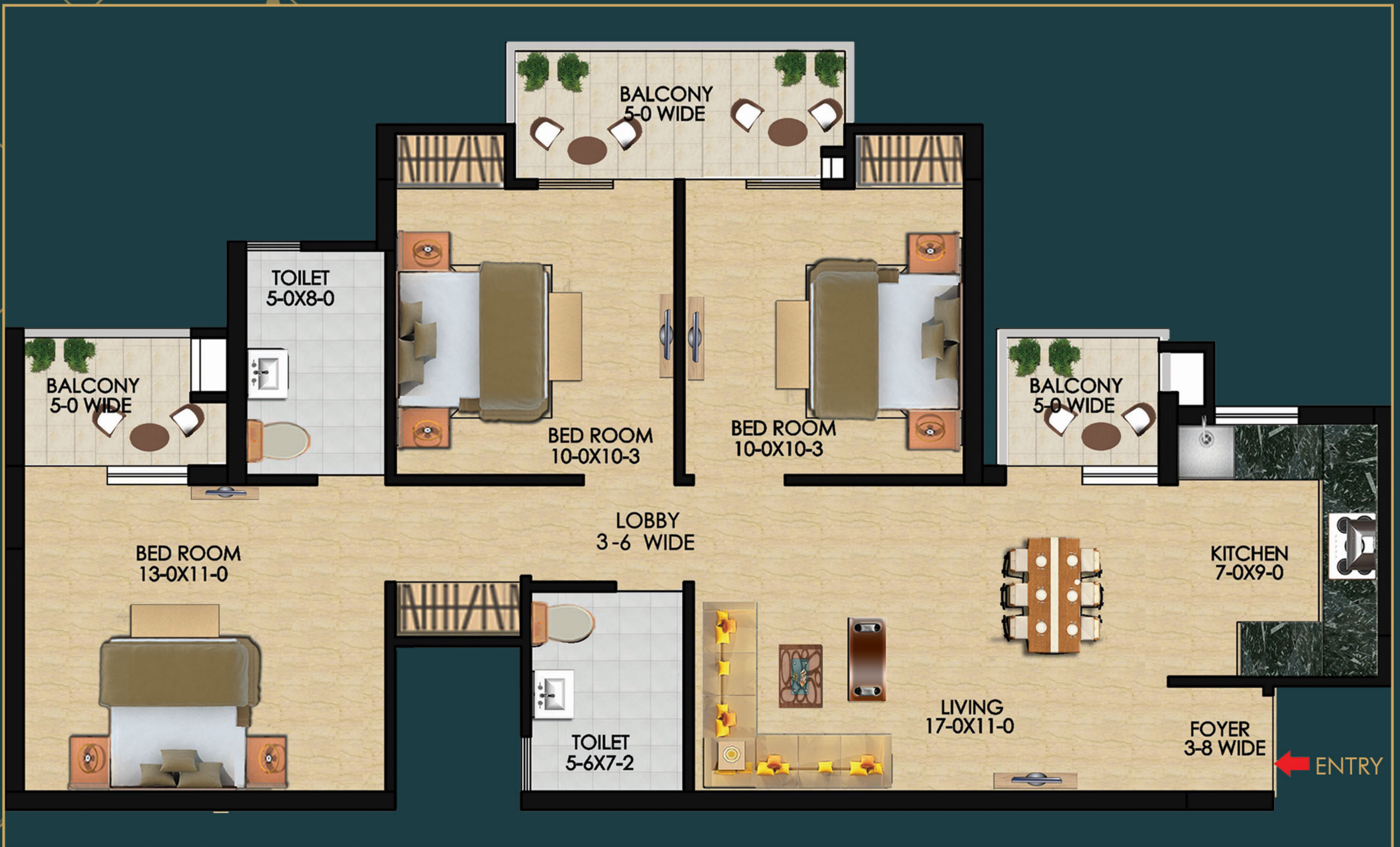
1295 SQ.FT. 3 BED ROOM+2 TOILET