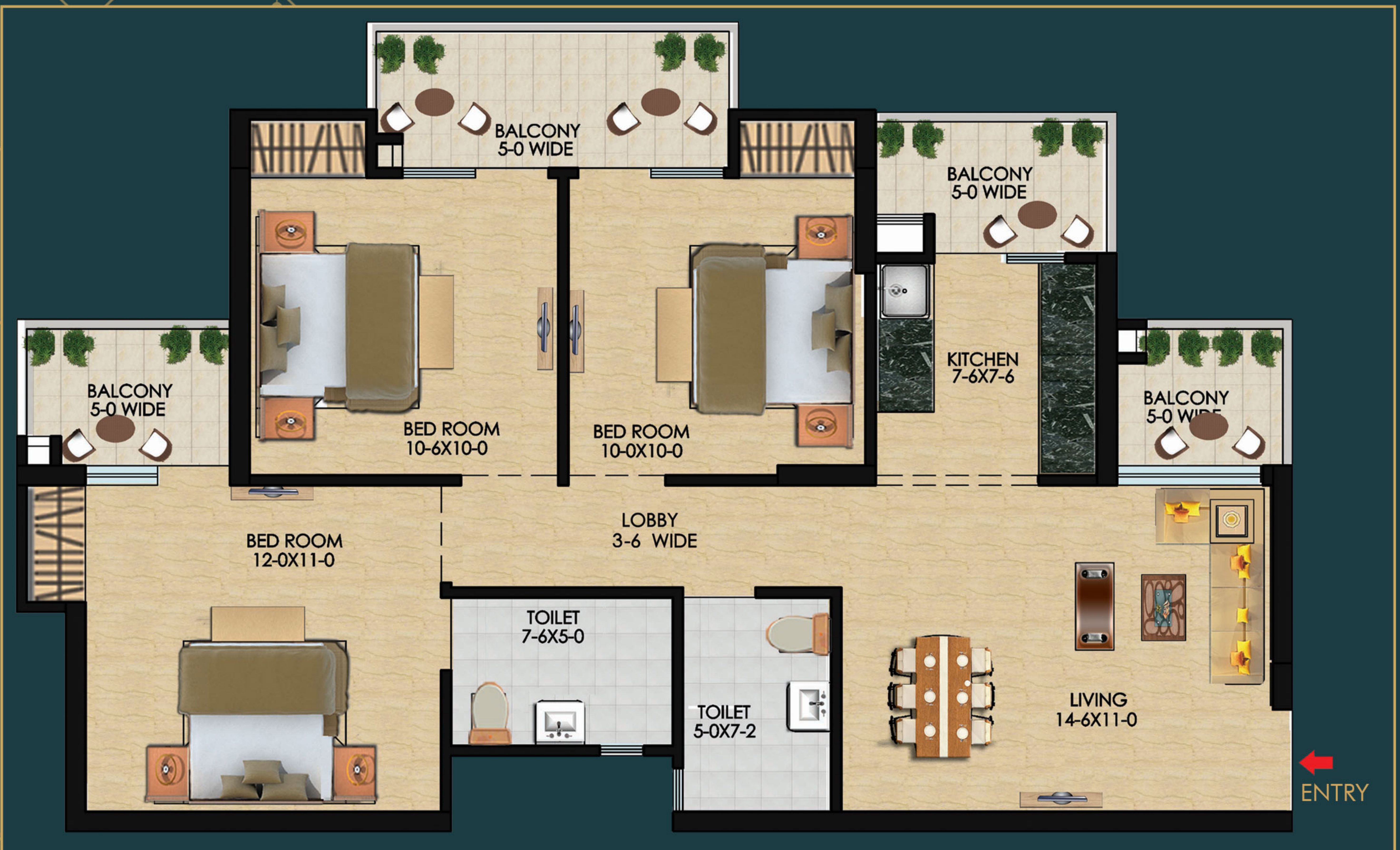
1240 SQ.FT. 3 BED ROOM + 2 TOILET