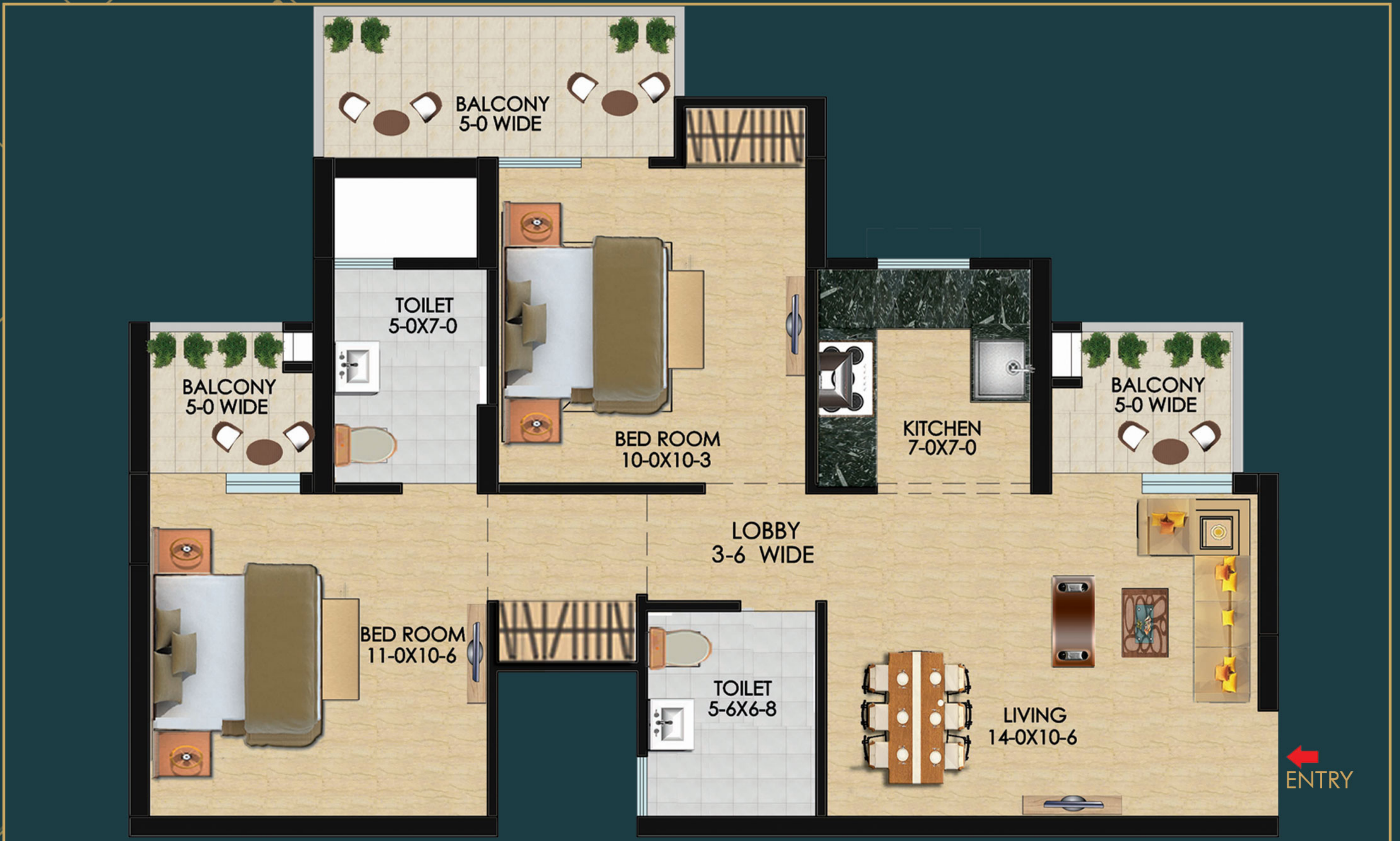
972 SQ.FT. 2 BED ROOM + 2 TOILET