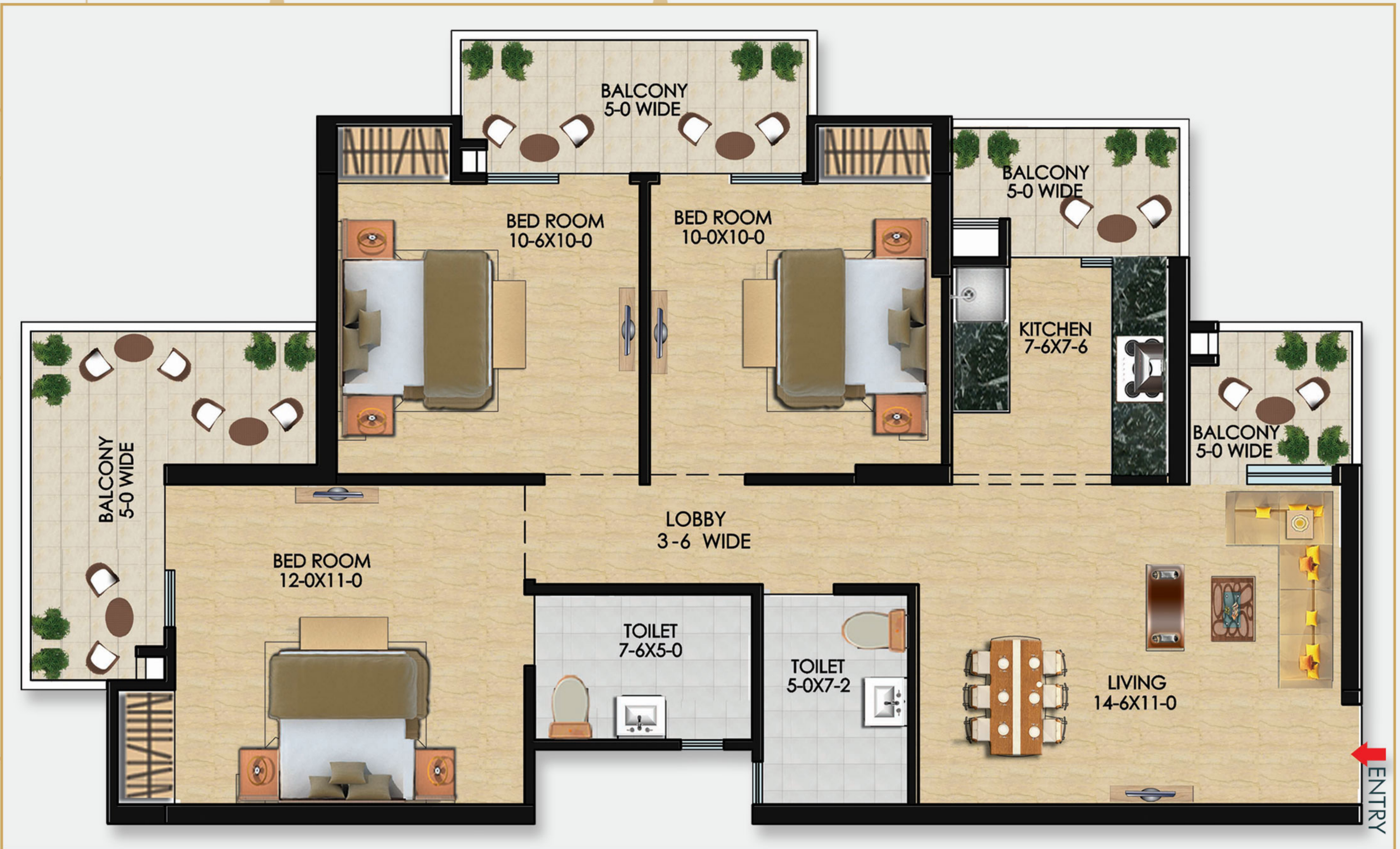
1290 SQ.FT. 3 BED ROOM + 2 TOILET