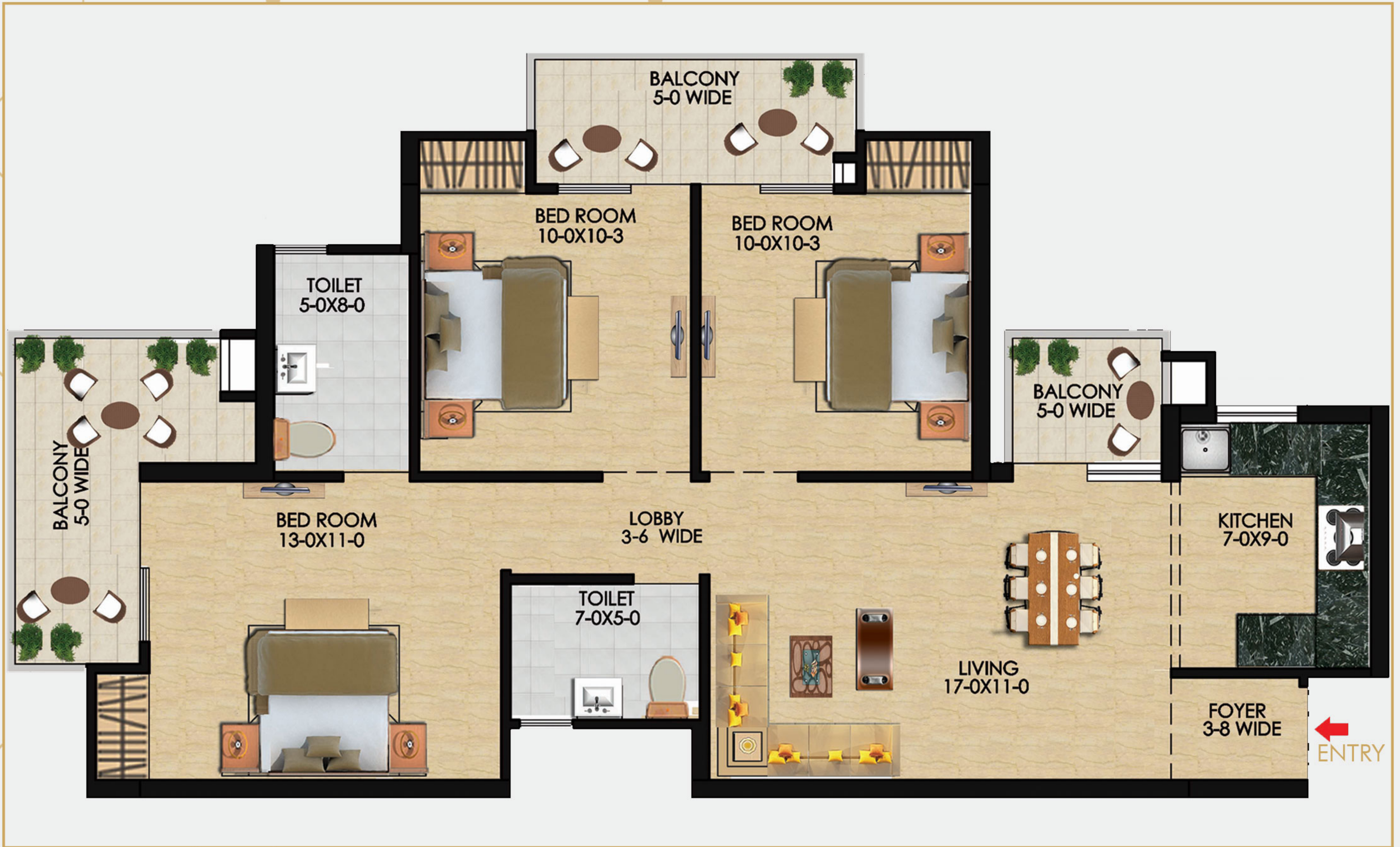
1340 SQ.FT. 3 BED ROOM+2 TOILET