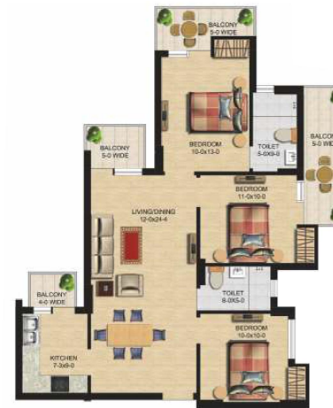
TYPE 3C 3 BEDROOM UNIT PLAN