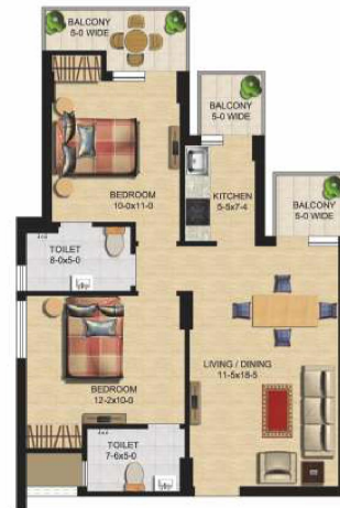
TYPE 3 2 BEDROOM UNIT PLAN