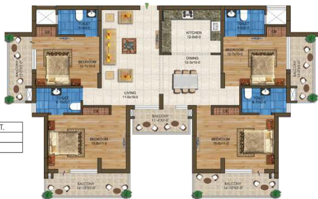
TYPE 3B 4 BEDROOM UNIT PLAN