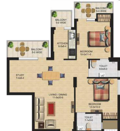
TYPE 2C 2 BEDROOM UNIT PLAN