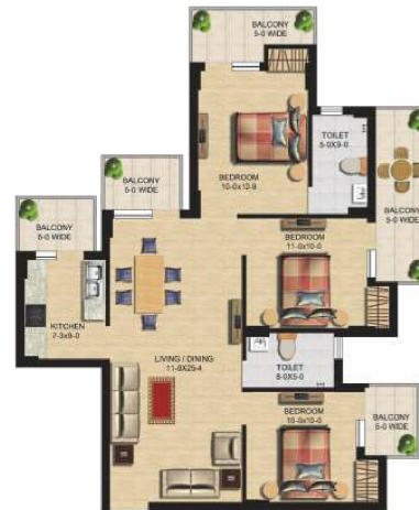
TYPE 3B 3 BEDROOM UNIT PLAN