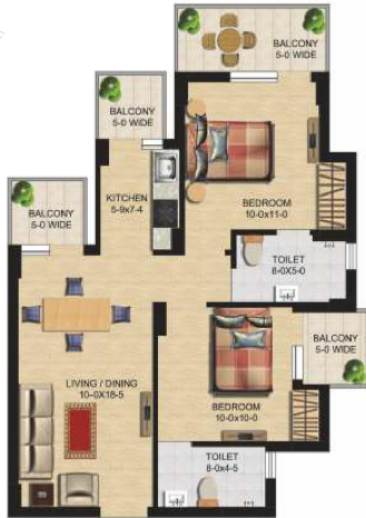
TYPE 2A 2 BEDROOM UNIT PLAN