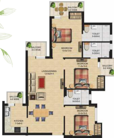
TYPE 3A 3 BEDROOM UNIT PLAN