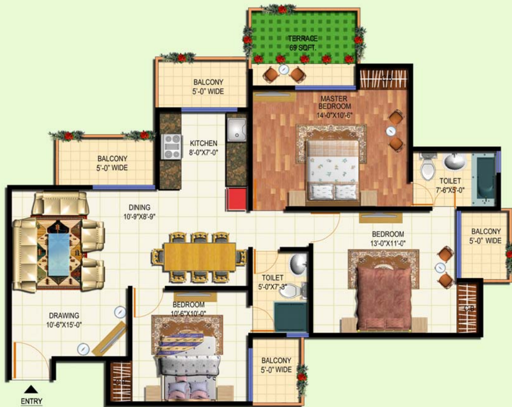
3 BED 2 TOILET WITH TERRACE