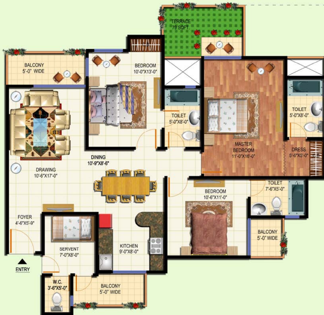
3 BED 4 TOILET SERVANT WITH TERRACE