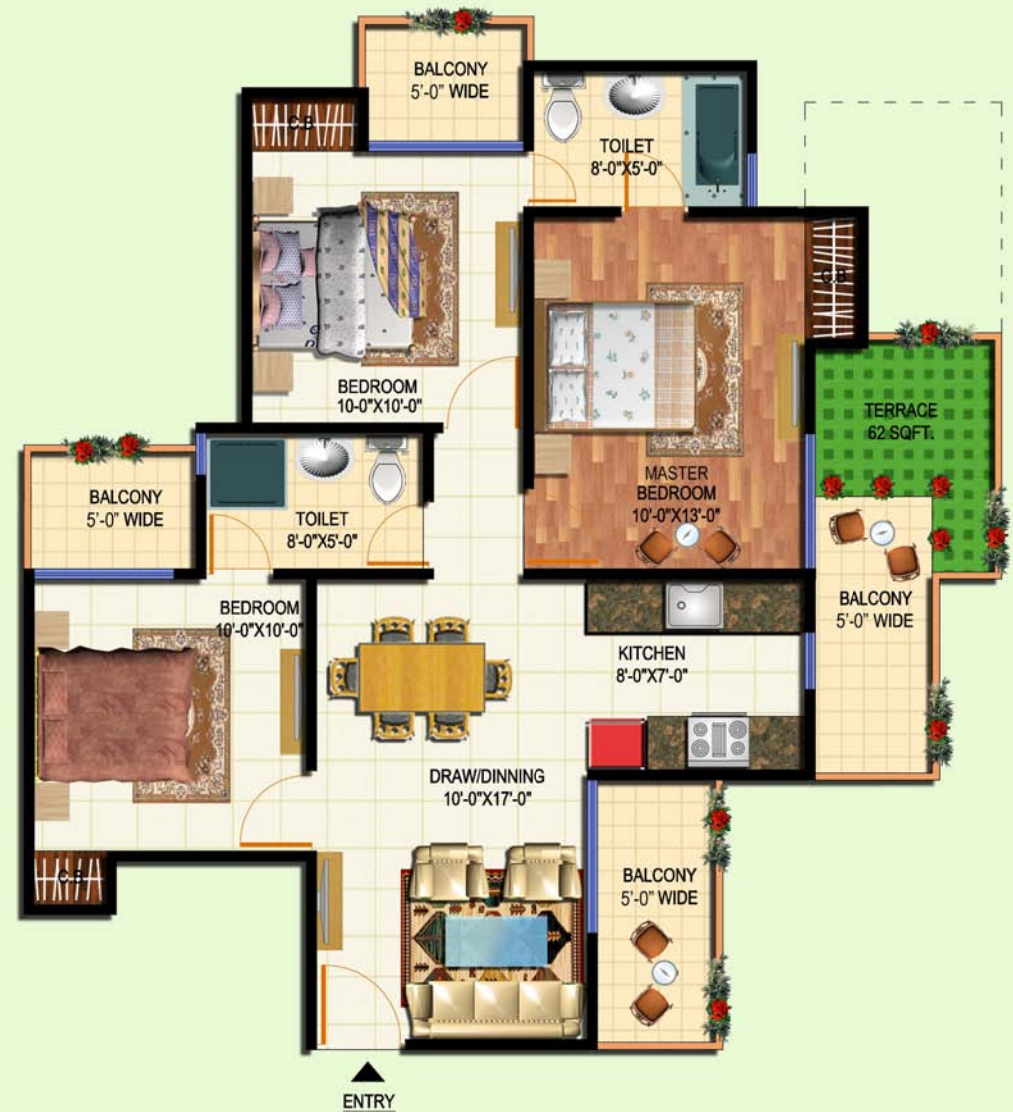
3 BED 2 TOILET (SMALL) WITH TERRACE

Architects: Deepak Mehta and Associates, Plot No. 16, Abhishek Plaza L.S.C. Mayur Vihar ph II Delhi-91