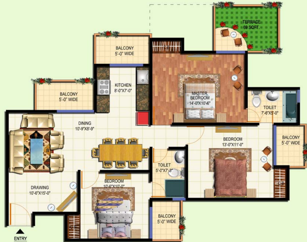
3 BED 2 TOILET WITH TERRACE