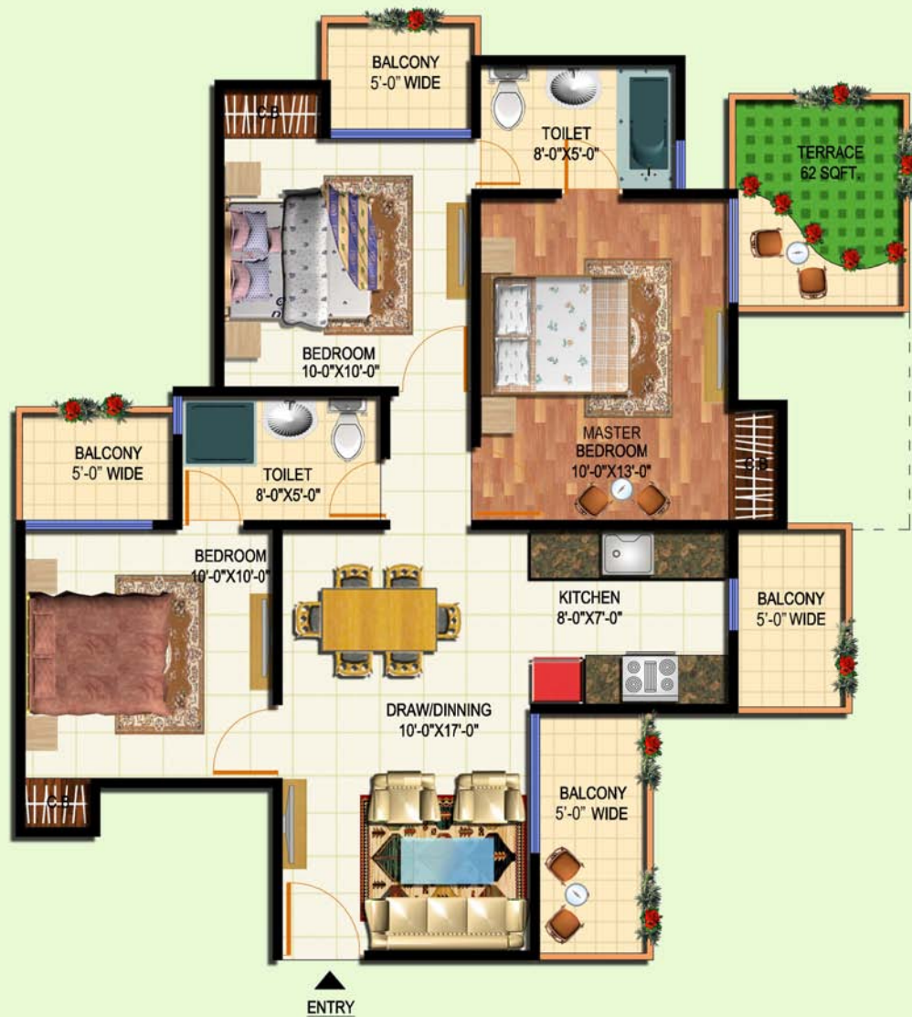
3 BED 2 TOILET (SMALL) WITH TERRACE