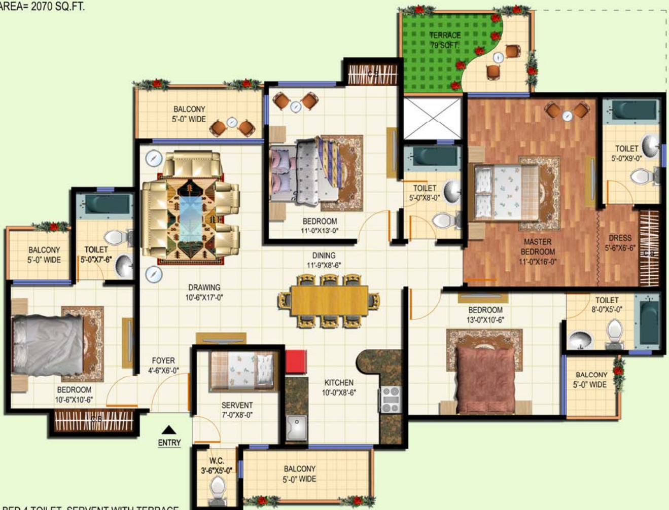
4 BED 4 TOILET SERVENT WITH TERRACE AREA= 2070 SQ.FT.

PROPOSED GROUP HOUSING FOR "AMRAPALI CENTURIAN PARK" AT NOIDA EXTN. Architects: Deepak Mehta and Associates, Plot No. 16, Abhishek Plaza L.S.C. Mayur Vihar ph II Delhi-91