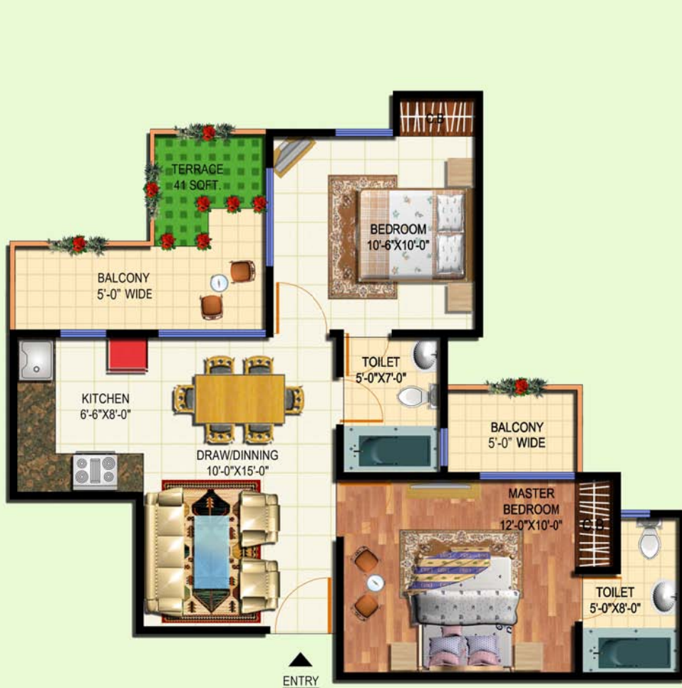
2 BED 2 TOILET WITH TERRACE AREA= 885 SQ.FT.