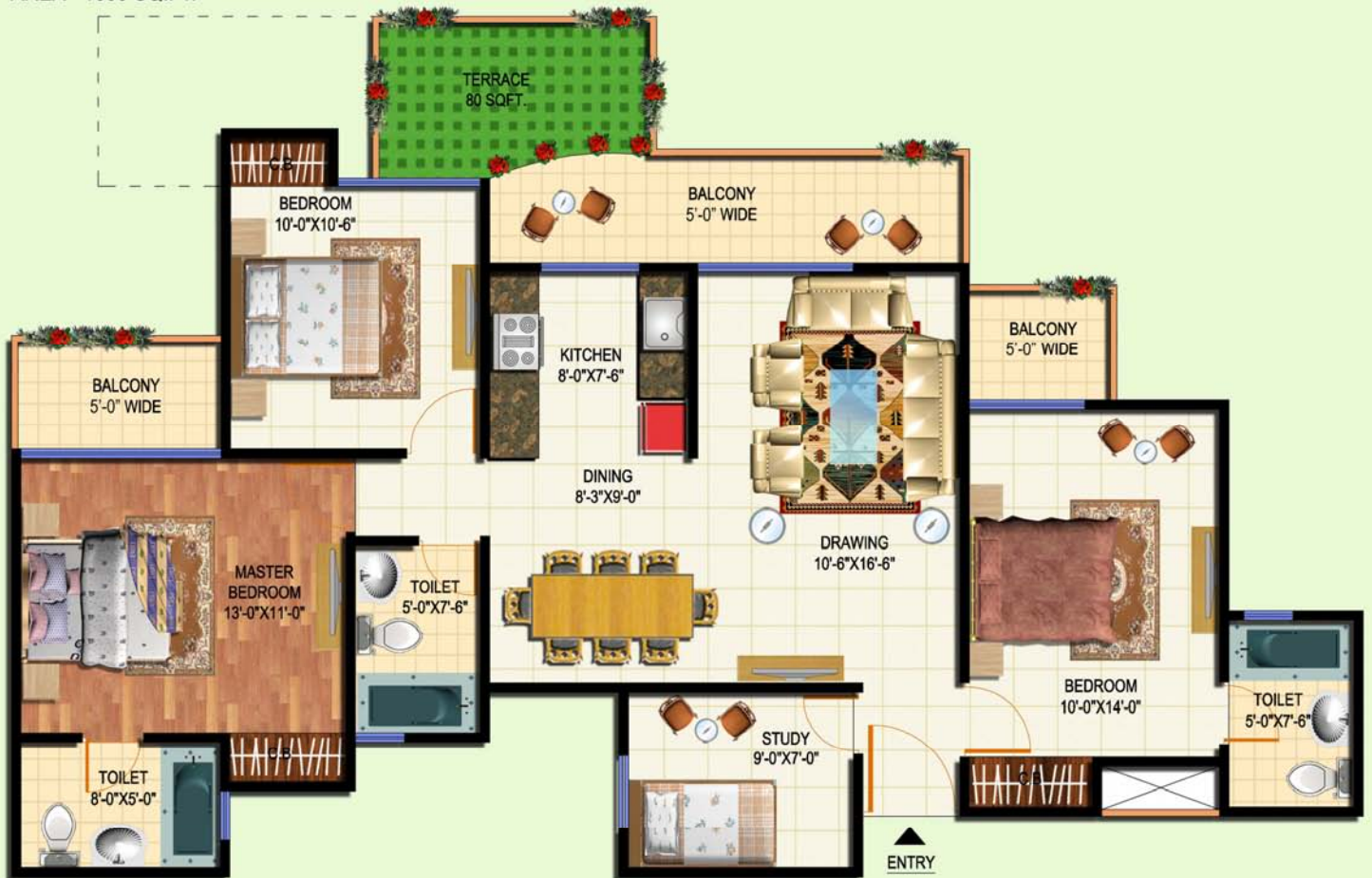
3 BED 3 TOILET WITH TERRACE AREA= 1600 SQ.FT.