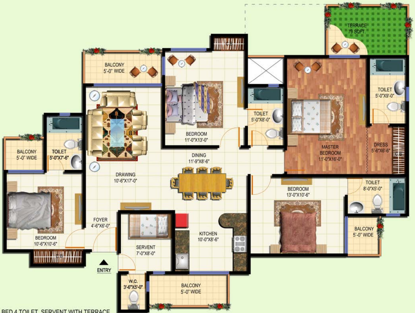
4 BED 4 TOILET SERVENT WITH TERRACE AREA= 2070 SQ.FT.