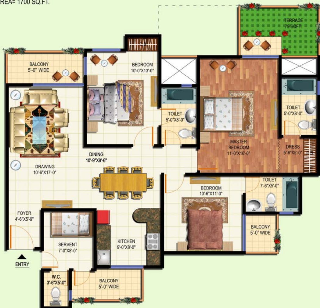
3 BED 4 TOILET SERVANT WITH TERRACE