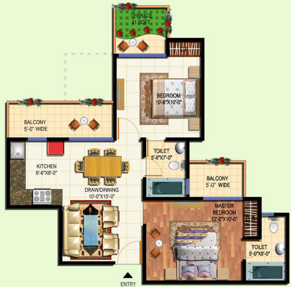
2 BED 2 TOILET WITH TERRACE

PROPOSED GROUP HOUSING FOR "AMRAPALI CENTURIAN PARK" AT NOIDA EXTN. Architects: Deepak Mehta and Associates, Plot No. 16, Abhishek Plaza L.S.C. Mayur Vihar ph II Delhi-91