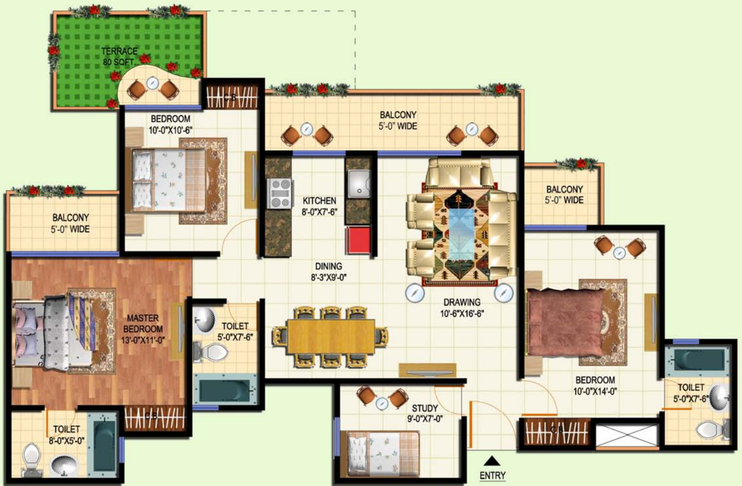
3 BED 3 TOILET WITH TERRACE AREA= 1600 SQ.FT.