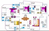
Floor Plan F