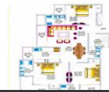
Floor Plan D